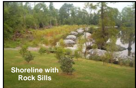
Shoreline with Rock Sills