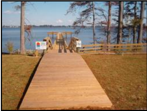
Fishing Pier (above) and Canoe-Kayak Access (below)

Perquimans County recently completed construction of a 200 foot-long public fishing pier at the Perquimans Community Center. The pier is handicap accessible from the main parking lot. A 40'x10' area at the end of the pier provides room for fishing and enjoying the scenic beauty of the Perquimans River.