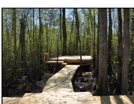
One of 3 newly constructed camping platforms on Bennett's Creek

Construction is in the final stages to complete 3 raised camping platforms and 3 primitive campsites along Bennett's Creek in Merchants Millpond State Park. Completion is targeted by the end of September in anticipation of a busy Fall for visitors to the park.