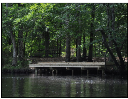
Canoe and kayak access to the raised camping platforms

Many of the park's 200,000+ visitors each year come to paddle the Millpond and Bennett's Creek, and the addition of the campsites will provide a much needed resource for the Albemarle Regional Paddle Trail System and the NC Paddle Trails System. The primitive campsites will be equipped with grills and picnic tables.