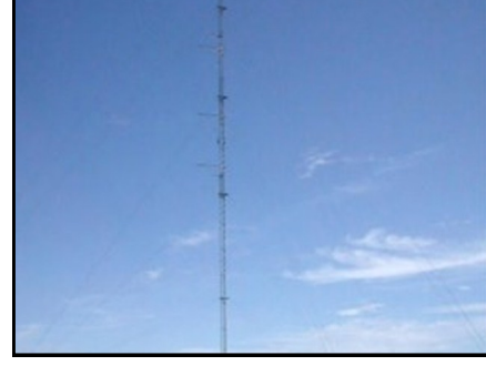
Students at COA-Edenton will be trained to install and repair Meteorological (Met) Towers. Met towers provide key data for community wind energy projects in the area.

Partners on the project include Elizabeth City State University, Northeast Workforce Development Board, College of the Albemarle, Dare County Schools, NC Solar Center, Appalachian State University, UNC Coastal Studies Institute, Alpha Energy, ECWindPower and