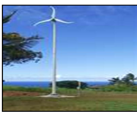
Schools in Dare and Currituck Counties have been selected to receive the first of four Wind Turbines.