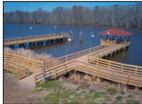
The project renovated three fishing piers and constructed a new boardwalk connector to provide handicap access.

The Albemarle RC&D Council provided technical and administrative support to the project.