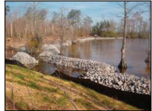
The project installed about 1,000 ft of rock sill to help prevent shoreline erosion.

Storm surge and heavy rain from Hurricane Isabel removed about 30 feet of shoreline bluff in front of the multi-million dollar Recreation Center in Perquimans County. The county, with technical assistance from Albemarle RC&D Council, Perquimans Soil and Water, and Natural Resources Conservation Service has stabilized about 450 ft of shoreline bluff in front of the Recreation Center building, and installed about 1,000 ft of rock sill in shallow water along the property shoreline. Native trees, shrubs and grasses will be planted along the bluff and shoreline to help stabilize this important piece of public property.