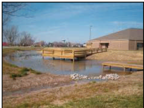
The new wetland next to the RRMS has a handicap accessible pier for classroom instruction and two platforms for water sampling.

Close to a major U.S. Coast Guard Base and Elizabeth City State University, River Road Middle School (RRMS) is located in one of the fastest growing areas of Elizabeth City. Farm land on all sides of the school is being converted to residential housing. Non-point stormwater runoff from the school and new residential areas is a major concern for water quality because the area drains directly to the Pasquotank River. The stormwater runoff from this area carries N and P fertilizers from recreational fields and lawns. Stormwater is also known to be a major carrier of fecal coliform bacteria, which contaminates the river and negatively affects shellfish harvesting.