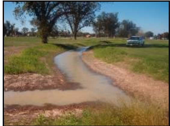
A drainage ditch between the RRMS and recreational soccer fields was converted into a living wetland.

Close to a major U.S. Coast Guard Base and Elizabeth City State University, River Road Middle School (RRMS) is located in one of the fastest growing areas of Elizabeth City. Farm land on all sides of the school is being converted to residential housing. Non-point stormwater runoff from the school and new residential areas is a major concern for water quality because the area drains directly to the Pasquotank River. The stormwater runoff from this area carries N and P fertilizers from recreational fields and lawns. Stormwater is also known to be a major carrier of fecal coliform bacteria, which contaminates the river and negatively affects shellfish harvesting.