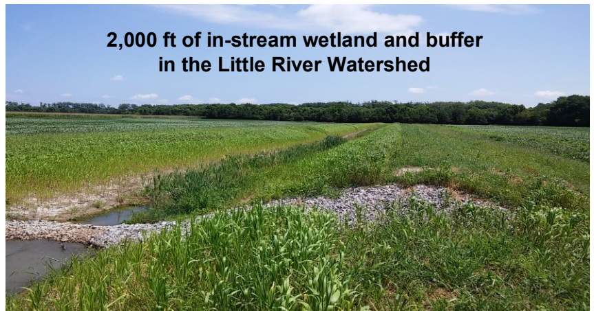
2,000 ft of in-stream wetland and buffer in the Little River Watershed