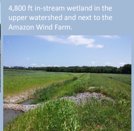
4,800 ft in-stream wetland in the upper watershed and next to the Amazon Wind Farm.