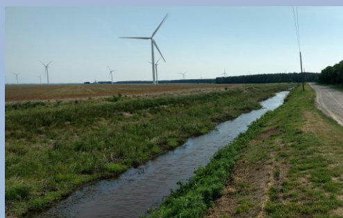
2,000 ft in-stream wetland just above the impaired section of the Little River.

The ARC&D worked with volunteers in the Green Saves Green group to organize the first Green Saves Green Expo at the Museum of the Albemarle in Elizabeth City. Approximately 1,600 people attended the event with 60 sponsors and vendors. Three van tours carried people to see the Amazon Wind Farm. They also learned about ARC&D in-stream wetland projects and the partnership to restore the Little River Watershed. The ARC&D continues to work with the Green Saves Green group on new projects.