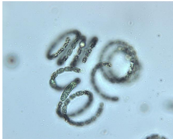
Figure 2: Dolichospermum spiroides