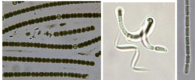
Figures 3, 4, 5: Dolichospermum , Cylindrospermopsis , Pseudanabaena