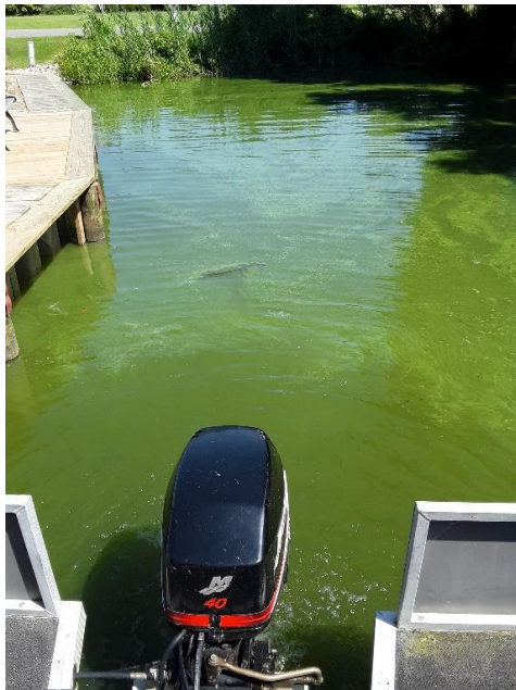
Figure 2: Little River on July 2 nd