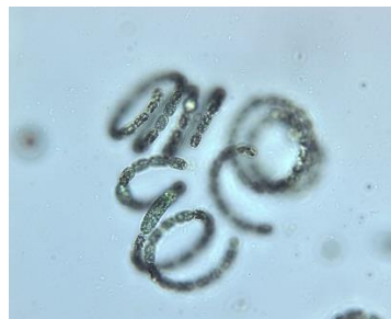
Figure 3: Dolichospermum