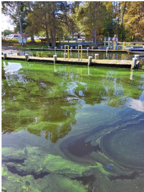
Figure 2: River on 10/21/20